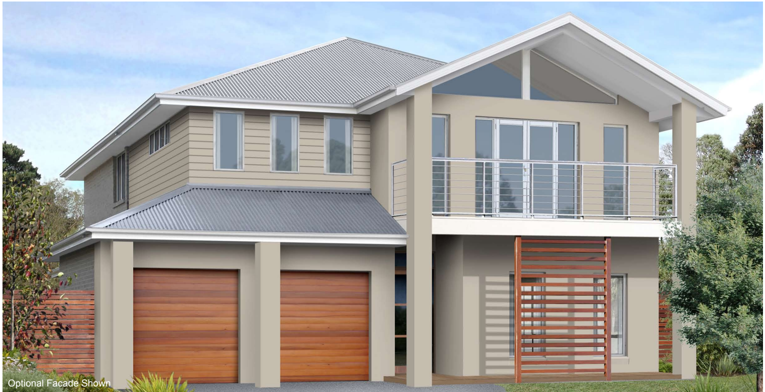
Optional Facade Shown