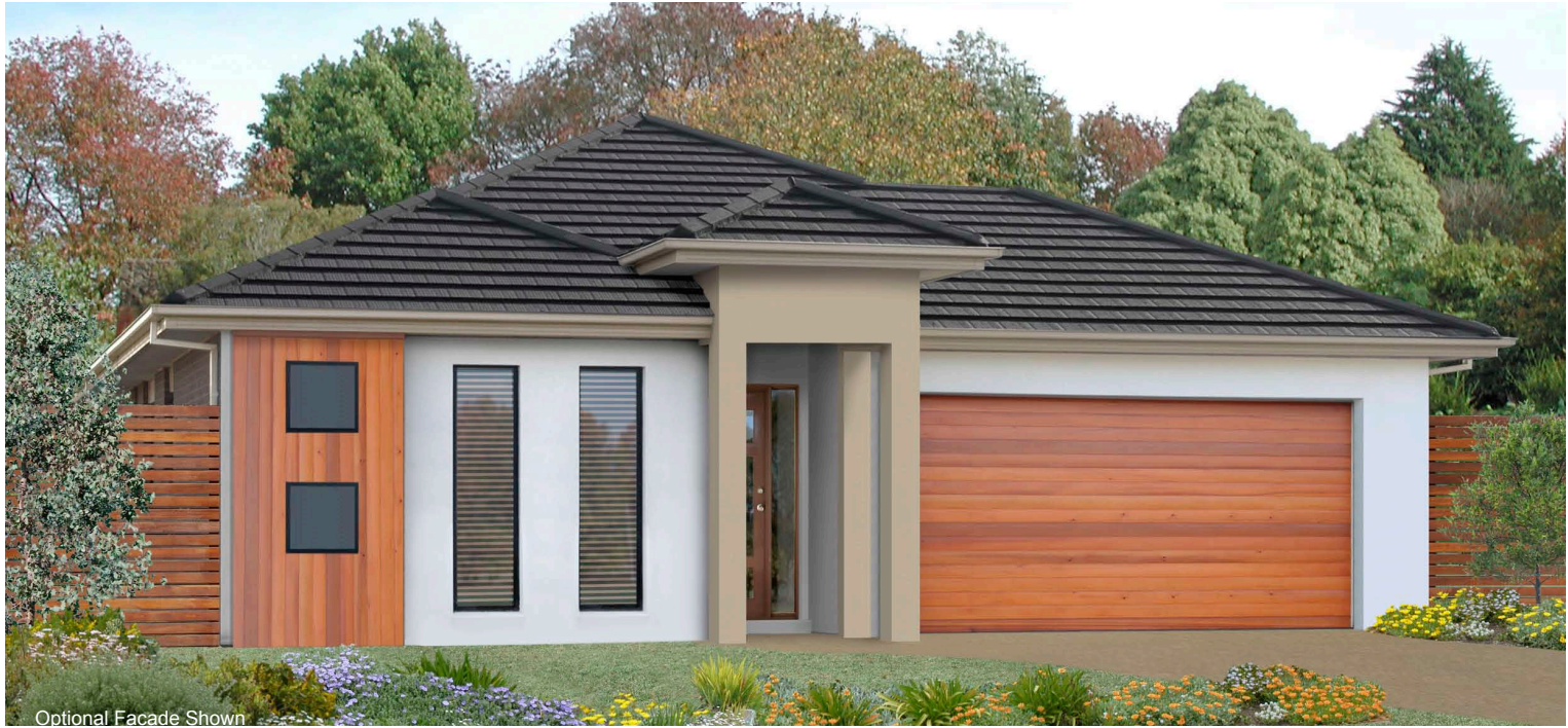
Optional Facade Shown